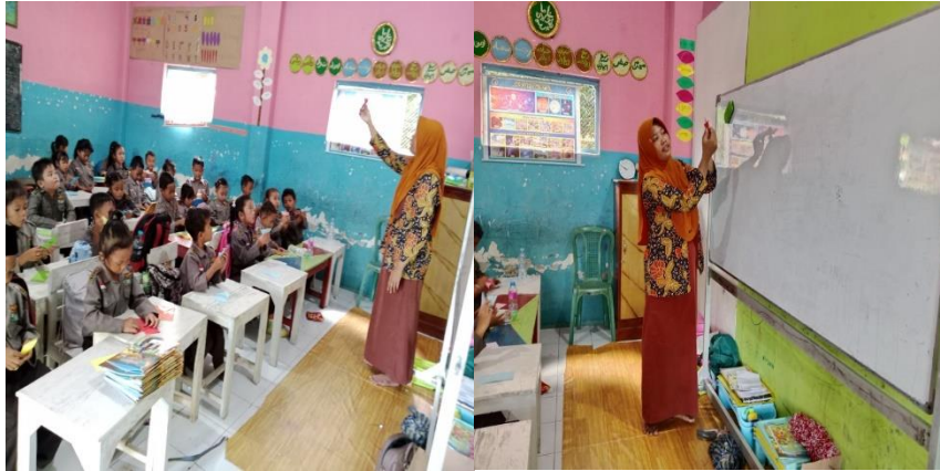
Figure 2. Learning to Fold Origami Paper

Motor development is defined as the development of elements of maturity and control of body movements (Gallahue, 2010). In the process of child development, gross motor skills develop first compared to fine motor skills. This is proven by the fact that children can already use their leg muscles to walk before they are able to control their hands and fingers to draw or cut. Gross motor skills begin with play which is a rough movement. At the age of 3 years according to the development stage, children generally have mastered most of the gross motor skills. Motoric is a translation of the word "motor" which according to Samsudin is a biological or mechanical basis that causes movement. In other words, movement is a reflection of an action based on the motor process. Because motoric causes movement, every use of the word motor is always associated with movement. In everyday use, there is often no distinction between motor and movement. However, what must always be noted is that the movement in question is not solely related to movement as we see it every day, namely the movement of body parts (hands, arms, feet and legs) through the body's motor apparatus (muscles and skeleton), but motor skills are movement apparatus which involve motor functions such as the brain, nerves, muscles and skeleton .